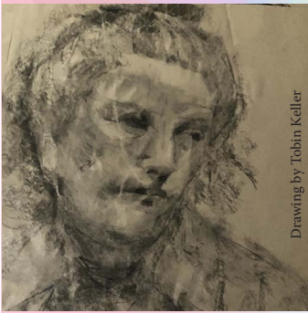
Drawing by Tobin Keller

September 2023 For a complete list of events visit ArtsMendocino.org