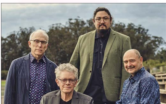
Kronos Quartet GUALALA ARTS CENTER GUALALA

This calendar is produced by the Arts Council of Mendocino County with support from the Mendocino County Tourism Commission. Printing is sponsored as a service to the arts by the Stanford Inn by the Sea. For information on lodging, restaurants, wine tours, and other events, go to VisitMendocino.com