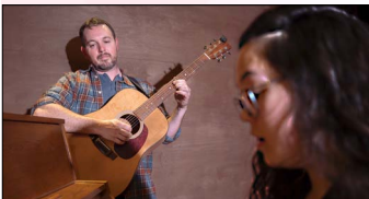
Once MENDOCINO COLLEGE UKIAH