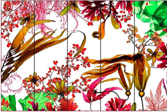
Curious World of Seaweed GRACE HUDSON MUSEUM UKIAH