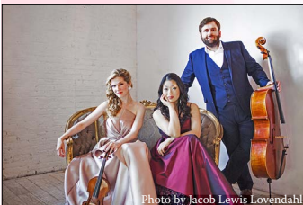
The Neave Trio PRESBYTERIAN CHURCH MENDOCINO