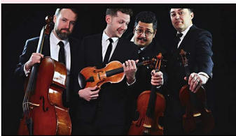
The Beo String Quartet GUALALA ARTS CENTER GUALALA