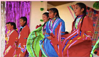
Exploramos Juntos MENDOCINO COUNTY MUSEUM WILLITS