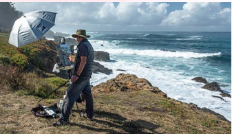
Mendocino Open Paint Out MENDOCINO