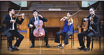
The Telegraph Quartet MENDOCINO COLLEGE THEATER UKIAH