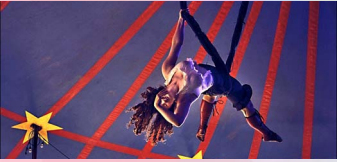
Flynn Creek Circus MENDOCINO COLLEGE COAST CAMPUS FORT BRAGG

September 2022 For a complete list of events visit ArtsMendocino.org