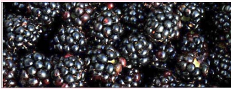
Round Valley Blackberry Festival COVELO

▶ August 6 & 7 , Art in the Gardens 2022 - Activities will include daily art workshops, art vendors, live music, food, and drinks. 11am - 5pm. Mendocino Coast Botanical Gardens, 18220 North Highway One, Fort Bragg . 707.964.4352, GardenByTheSea.org