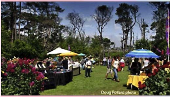
Art in the Gardens BOTANICAL GARDENS FORT BRAGG

For a complete list of events visit ArtsMendocino.org