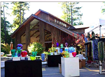
Art in the Redwoods GUALALA ART CENTER GUALALA

▶ August 20 & 21 , 61st Annual Art in the Redwoods Festival - art vendors, fine art exhibits, food, music and more under the redwoods. 10am - 4pm at Gualala Arts Center, 46501 Old State Highway, Gualala . 707.884.1138, GualalaArts.org