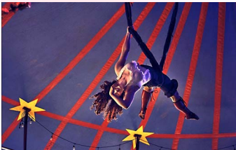
Flynn Creek Circus GIORNO PARK UKIAH

▶ August 18 - 21 , Flynn Creek Circus Presents "Balloons, Birds and Other Flying Things" - an all human circus with wild acrobatics, comedy, and awe-inspiring stunts. Thurs & Fri at 8pm, Sat, 1, 5 & 8pm, Sun, 1pm, ( adults 21+ only at 8pm show on Aug 20 ). Giorno Park, 506 Park Blvd, Ukiah . 707.684.9389. FlynnCreekCircus.com