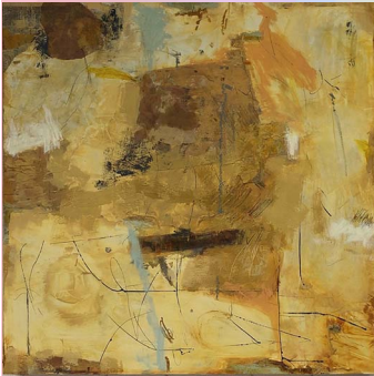
Members' Juried Exhibit MENDOCINO ART CENTER MENDOCINO JAN 7 - FEB 26

For a complete list of events visit ArtsMendocino.org