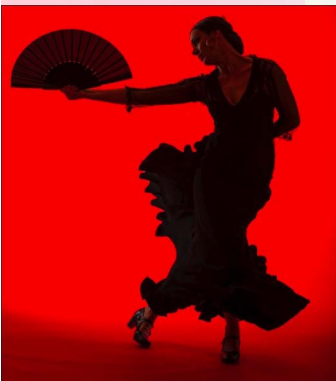
An Evening of Flamenco CASPAR COMMUNITY CENTER CASPAR SUN JULY 11

► Saturday July 31, Dance Mission Theater presents TUNES & TASTES with Holly Near and SonoMusette - A taste of Paris in Northern California with music. 5pm at Dos Rios Artist Retreat Center, 10501 Dos Rios Rd, Dos Rios . 415.826.444, tickets available at DanceMissionTheater.org