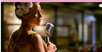
The Billie Holiday Project WILLITS COMMUNITY THEATRE WILLITS JUNE 2