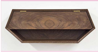
Krenov School's Midwinter Show CYPRESS STREET BARN FORT BRAGG FEB 2-10 RECEPTION FEB 8