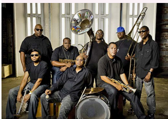
The Soul Rebels ARENA THEATER POINT ARENA FEBRUARY 23

► Friday February 1, Meet the artists in our community. Opening receptions for new exhibits are held each First Friday at Fort Bragg & Ukiah from 5-8 pm & at Gualala Arts Center from 5-7 pm. Fort Bragg galleries include: PACIFIC TEXTILE ARTS, EDGEWATER GALLERY, NORTHCOAST ARTISTS GALLERY, PARTNERS GALLERY & others. In Ukiah : CORNER GALLERY, ART CENTER UKIAH, GRACE HUDSON MUSEUM, PARADIGM and MENDOCINO COUNTY LIBRARY, UKIAH BRANCH. RECEPTIONS FOR NEW EXHIBITS AT THE DOLPHIN GALLERY (IN GUALALA) ARE HELD ON THE FIRST SATURDAY OF THE MONTH.